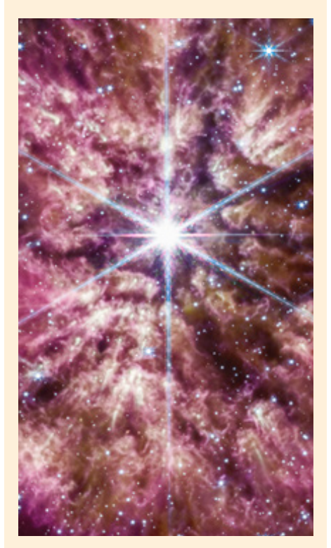
WR 124 from James Webb

of whatever nature or grade of being. Just as A Treatise on Cosmic Fire endeavoured to give the psychological key to The Secret Doctrine and to interpret the underlying consciousness which the Beings (considered in The Secret Doctrine) express, so in A Treatise on the Seven Rays, I am carrying on the same idea and, at the same time, seeking to give the needed key to modern exoteric psychology and also some indications as to the astrological key to The Secret Doctrine to which H.P.B. refers. The Entities dealt with in her masterpiece of esoteric truth are here revealed as cosmic, solar and planetary influences evoking-in response to Their outpoured energy or vibratory [EA291] activity-an awakening of consciousness in the form so that it becomes aligned to or closely related to Their Own. All revelations appear to emerge into the consciousness of the race in their lowest or most material form because the "ascent of knowledge towards wisdom" is always the key to progress, and, therefore, exoteric psychology and exoteric mundane astrology had to precede the revelation of their significance; the nature of the form had to be made apparent and man accustomed to it before the meaning behind the form could be revealed.